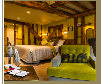
DOUBLE DELUXE BEDROOM Upgrade for an additional £180.00 per night