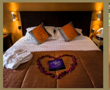
EXECUTIVE BEDROOM per night