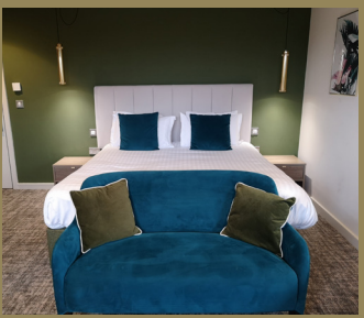
SUPERIOR BEDROOM per night